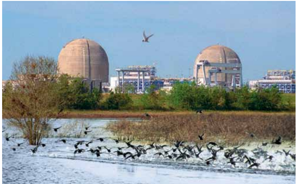
South Texas Project

✦ Nuclear energy is America's largest source of clean-air, carbon-free electricity, producing no greenhouse gases or air pollutants. Presently, nuclear energy produces electricity for one in five homes and businesses across the U.S. and nearly three quarters of all the country's clean-air electricity.